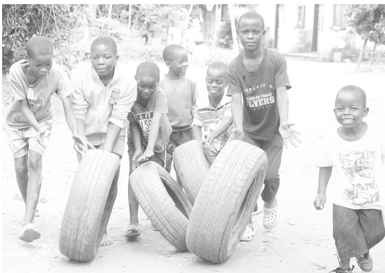
Children of Lusaka's Bauleni Compound play with used tyres

as illustrated through the PMI, revealed a sustained deterioration in business conditions during the first month of the New Year. "The headline figure derived from the Survey is the PMI. Readings above 50.0 signal an improvement in business conditions on the previous month, while readings below 50.0 show deterioration. At 48.1, the PMI continued to signal deteriorating economic conditions during January extending the current sequence of decline to six months. That said, the reading was up from 47.8 in December to indicate a slightly softer contraction," data revealed. And commenting on the Survey's findings, Stanbic Bank Zambia's head of global markets Victor Chileshe stated that consumer inflation may subside due to the relative stability of the kwacha against major currency convertibles. "Although higher fuel prices and currency weakness resulted in a sharp monthly increase in input costs, the rate of output price inflation moderated, which may be a sign that threats to a rise in consumer inflation are subsiding, especially since USD-ZMW remains stable," stated Chileshe. The Stanbic Bank Zambia PMI is based on data compiled from monthly replies to questionnaires sent to purchasing executives in approximately 400 private sector companies, which have been carefully selected to accurately represent the true structure of the Zambian economy, including agriculture and construction, among others.