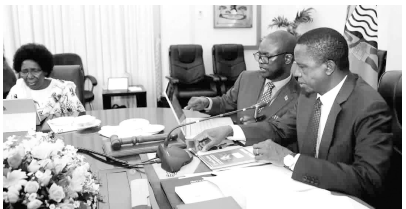
President Edgar Lungu (r) chairs the fourth Cabinet meeting at State House on Monday, as Vice- President Inonge Wina (l) follows the deliberations.