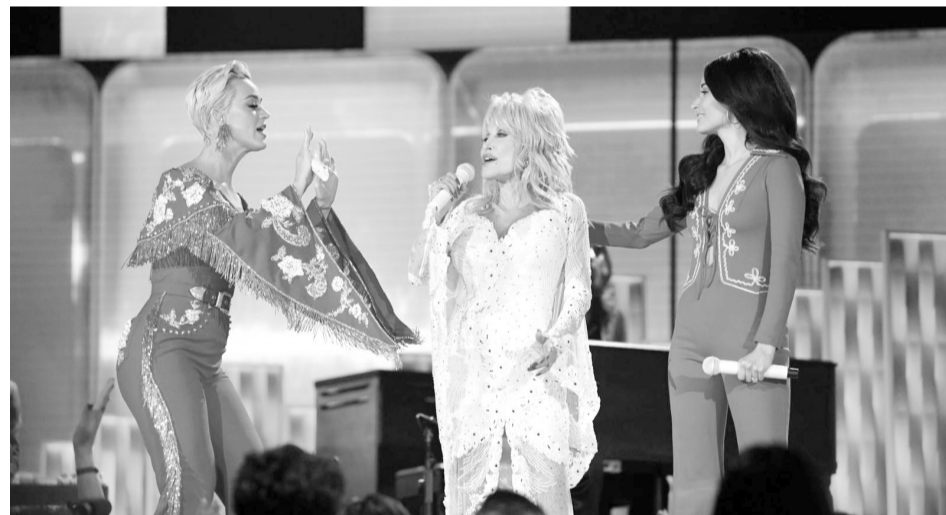
Dolly Parton (C) sings with Katy Perry (L) and Kacey Musgraves at the 2019 Grammy Awards

Dolly Parton has said there is still "a long way to go" for women in the workplace as she addressed gender equality before the launch of 9 to 5 The Musical in London.