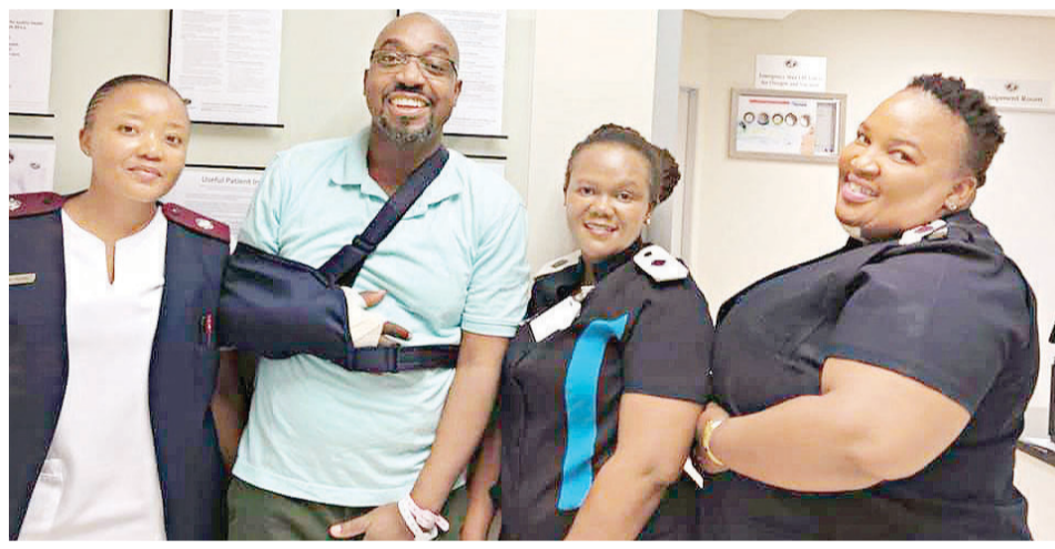
Transport Minister Brian Mushimba after being discharged from hospital in South Africa