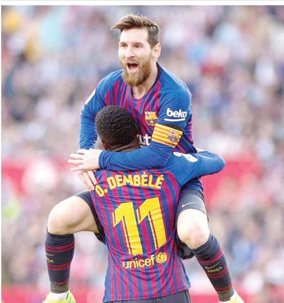
Lionel Messi who scored a hatrick for Barcelona away to Sevilla on Saturday evening, celebrates one of his goal with Ousmane Dembele