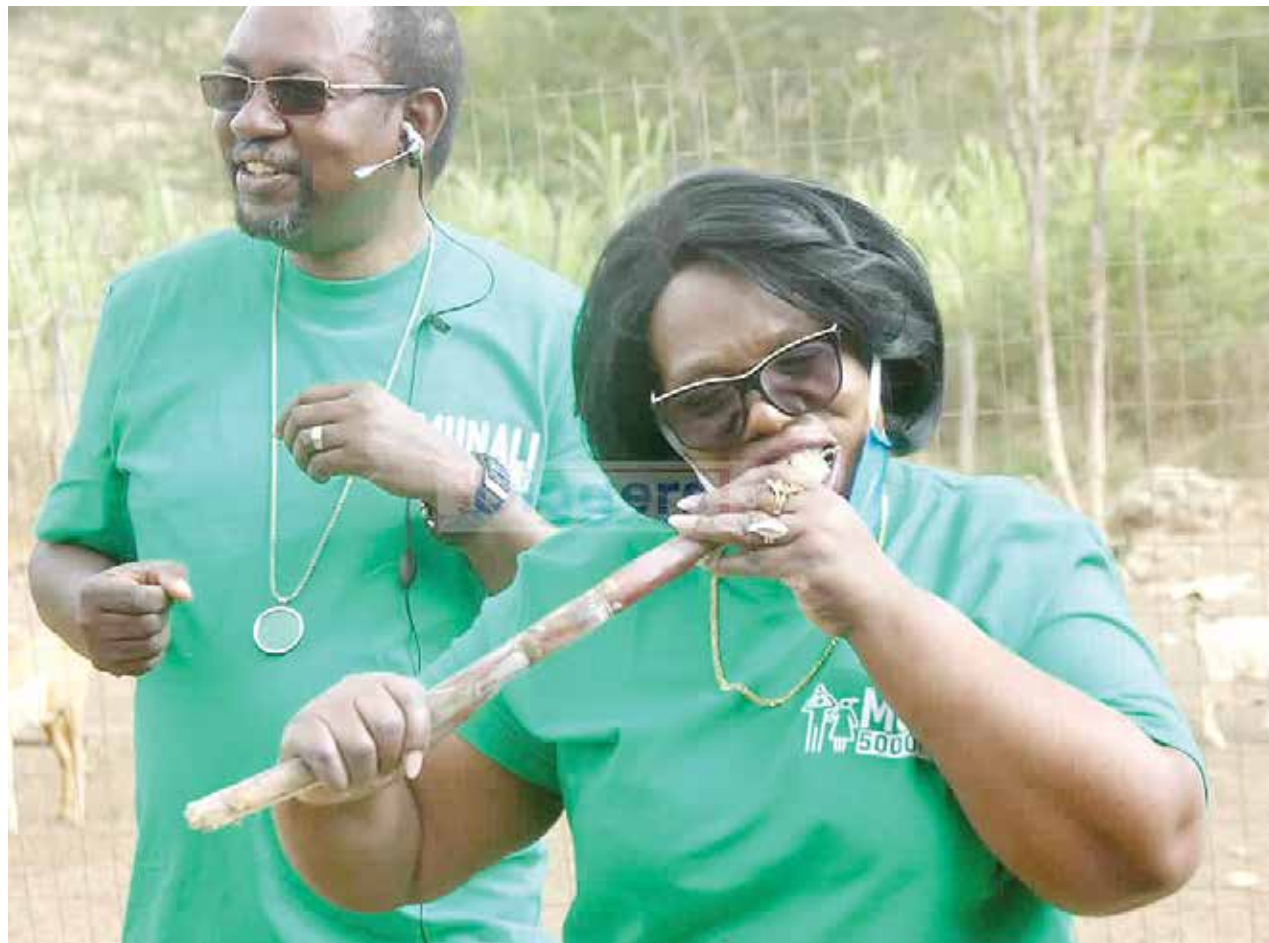
Livestock and Fisheries Minister Prof Nkandu Luo enjoys sugarcane shortly after the launch of the Munalu 5000 empowerment project in Chongwe

ZESCO Limited says it was losing over US$200 million annually to the "unfair and one-sided" nature of the Bulk Supply Agreement with Copperbelt Energy Corporation (CEC) that expired on March 31, 2020. Story page 7