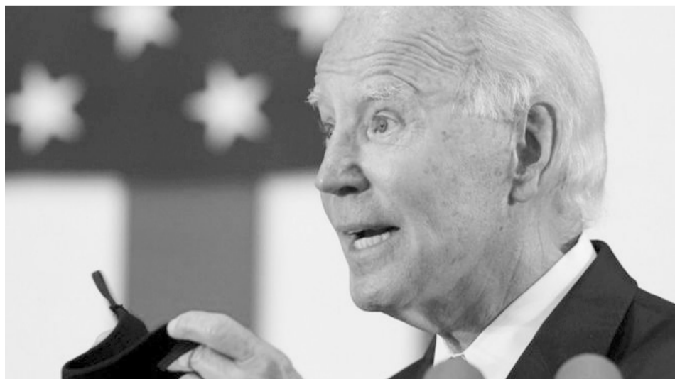
Mr Biden has a healthy lead in the polls, with just four months to go till the election

Funded by a combination of members' fees based on wealth and population and voluntary contributions BBC