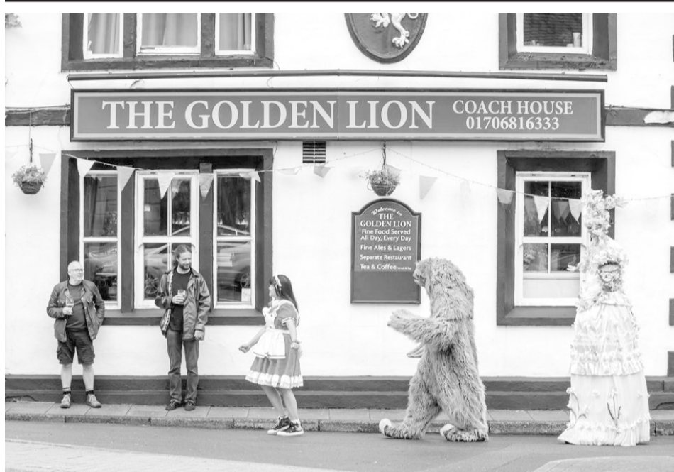
Street artists perform for costumers outside the Golden Lion pub in Todmorden, West Yorkshire

"No effort is being made to avoid any particular event, and the board aims to begin its work as early as possible. No exact date can be set yet as the technical and operational systems are still being set up." BBC