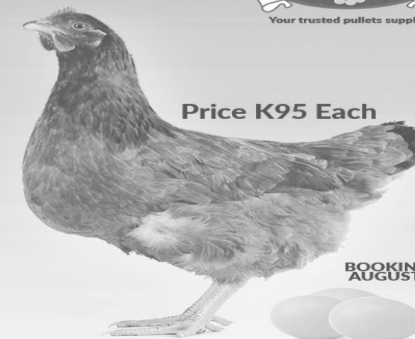
Price K95 Each