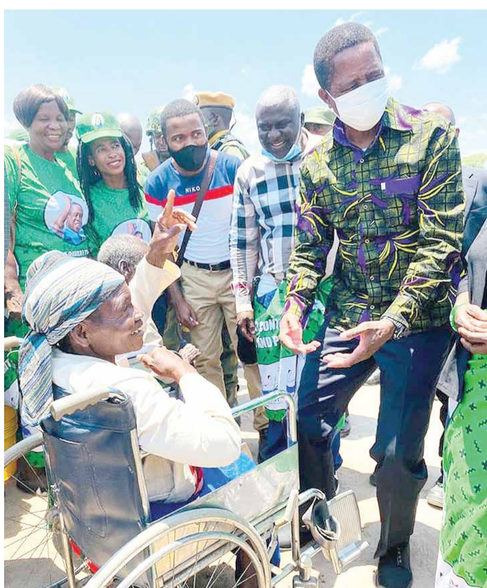
President Edgar Lungu jokes with an old lady in Chilubi district of Northern Province where he is on a two-day working visit