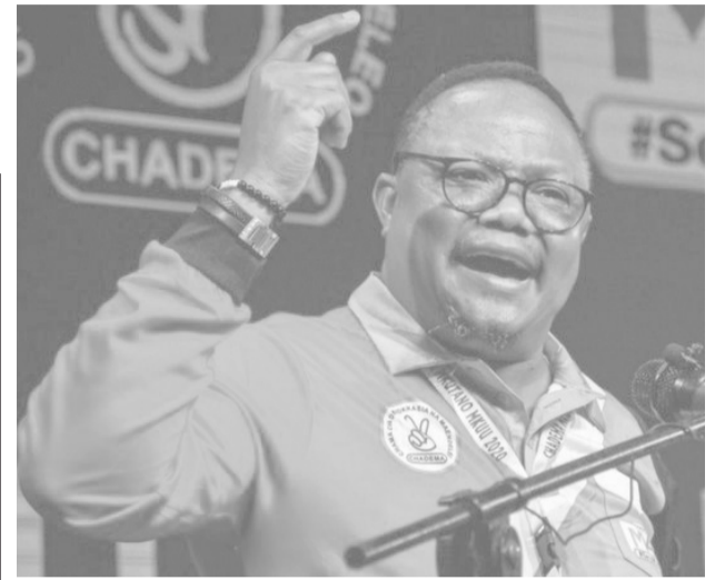
Tundu Lissu has a reputation for being outspoken

Voting itself was calm and peaceful on the mainland after reports of violence on Zanzibar on Tuesday.