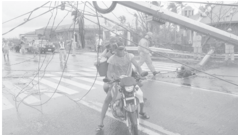
Power lines have been brought down by the storm

"The winds are fierce. We can hear the trees being